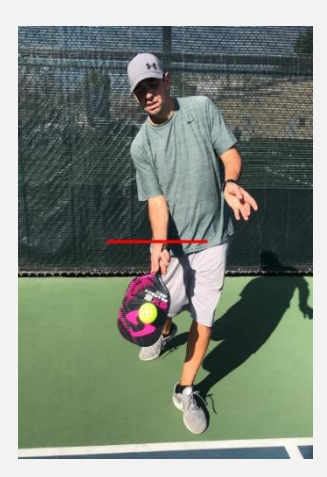
Figure 4-1 (legal serve)