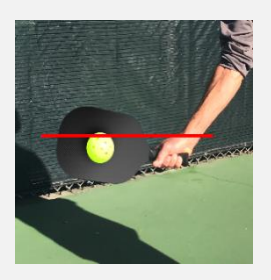
Figure 4-2 (illegal serve)