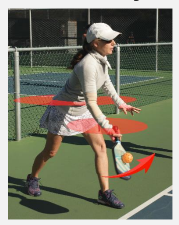
Figure 4-3 (legal serve)